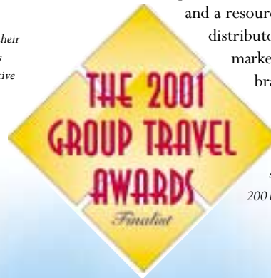
World of Whisky was shortlisted as ‘Best New Attraction 2001’ - Scotland’s only nomination.

Suddenly, Dewar’s have a fresh story, a unique experience based on the brand’s heritage and a resource that brings international distributors, sales people and their marketing partners to Scotland for brand ‘edutainment’ that no other medium can deliver.