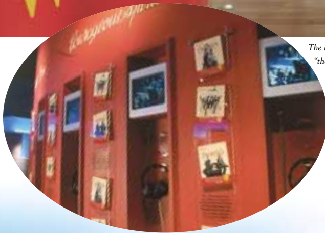
Visitors create their own experiences through interactive interpretation.