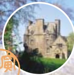
The Friendship Garden will be close to Lauriston Castle itself.