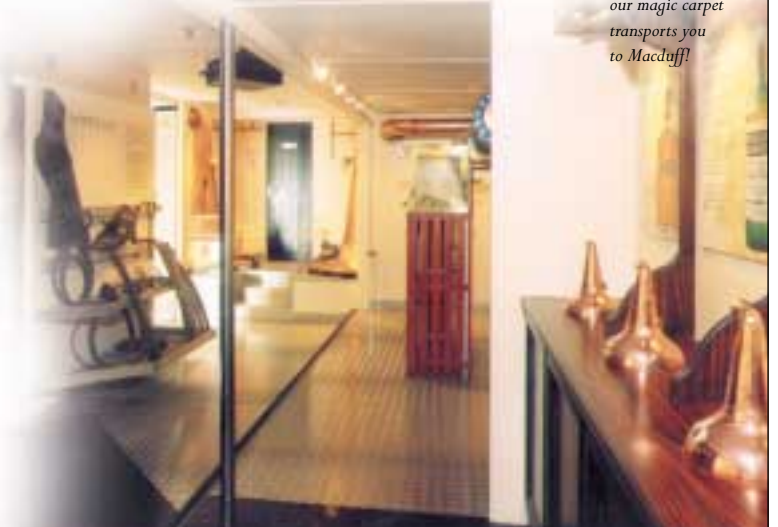
...and inside, our magic carpet transports you to Macduff!