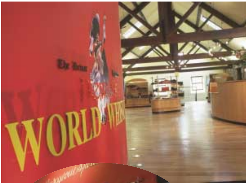
The dramatic entrance to “the ultimate Scotch Whisky visitor centre.”