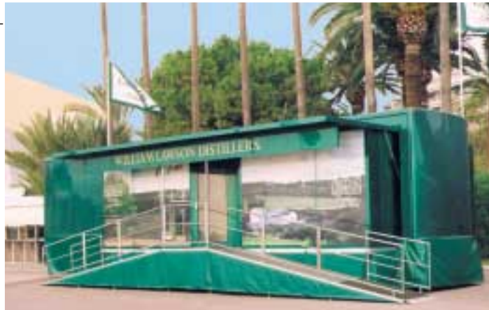
Outside...bringing Scotland to the seafront in Cannes

A leading trade magazine described it as a “magic carpet”. Having designed and built William Lawson's Distillery on the Road™, we were excited that others recognised its very special ability to take a tiny bit of Scotland to any corner of a foreign field (or supermarket, race meeting, trade fair...)